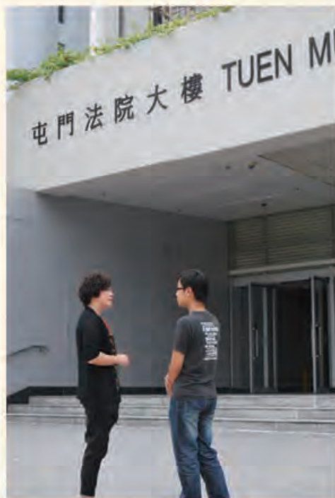
社工到法院為候審人士及其家人提供服務 Social worker goes to court to render service to defendants and their families.