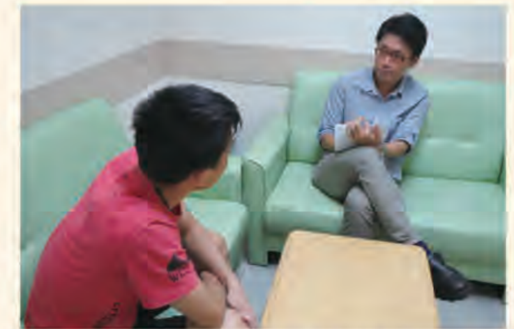
社工正使用「服務水平 / 個案管理量表」為服務使用者作危機及需要評估。Social worker was conducting Level of Service/Case Management Inventory (LS/CMI) risks and needs assessment.

In addition to casework, a membership based activity group was established under New Territories West Social Service Centre. A variety of social and recreational activities were organised on a regular basis. Members were encouraged to use their leisure time constructively, to develop a culture of self-help and mutual help, and to participate in volunteer services.