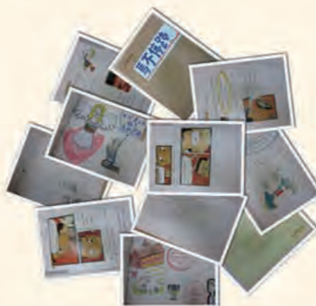
大學生為年長的服務者撰寫生命回憶錄。 University students wrote memoirs for our elder service users.