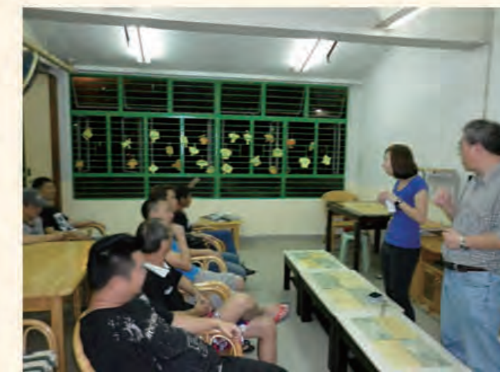
宿舍職員和舍友一同慶祝中秋節。 Our hostel staff celebrated the Mid-Autumn Festival with service users.