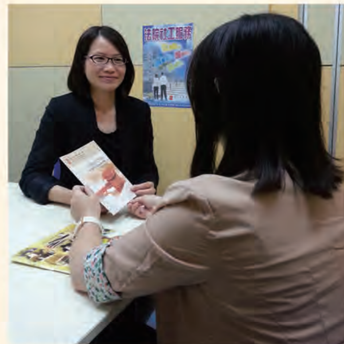
法院社工向求助者介紹相關服務，協助他們面對訴訟程序。 Court social worker familiarizes those seeking help with our services; and helps them go through the prosecution process.