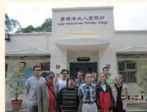
服務使用者到麥理浩夫人度假村旅行。 Service users visited Lady MacLehose Holiday Village.

竹園康樂中心以「認識香港，關心社區」為主題，透過各項興趣課程、戶外活動和社區參與，讓更生人士能夠融入社會，建立正面的價值觀，並善用閒暇，重建健康生活模式。