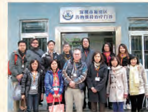
同工於退修日探訪春雨社會服務中心。Our staff visited Chunyu Social Service Centre in Shenzhen on staff retreat day.

本中心成立「偉志同樂坊」，定期為會員安排各種有益身心的社交及康樂活動，鼓勵會員善用餘暇、互相合作及參與義務工作。