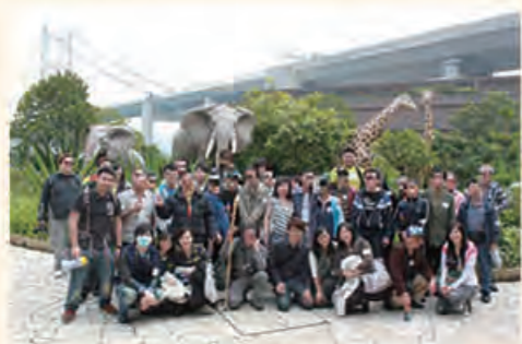
服務使用者參觀挪亞方舟主題公園。 Service Users visited the Noah's Ark Theme Park.

香港康樂中心為居住於港島區的更生人士提供服務，而竹園康樂中心則為九龍及新界區的更生人士提供服務。