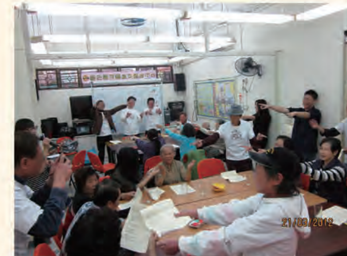
藝術義工到長者中心服務。 Arts angel volunteers visited the elderly.

In the past year, Hong Kong Jockey Club Community Project Grant: Project Oasis has established many networks and enriched its mode and media of intervention. The Project cooperated with community arts organisations to provide arts training for ex-offenders, who acted as "arts angels" to serve the elderly and other people in the community on a regular basis. A group of university students were recruited to write memoirs for elder service users hoping to remind them of the meaning of life. Service users were also encouraged to participate in the "Forum Theatre" to disseminate anti-drug messages. Some even started a band, using music as a means, to rediscover new interest in life.