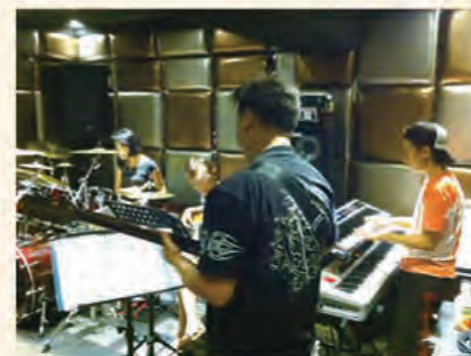
服務使用者組成樂隊，培養音樂興趣。 Service users started a group band to raise their interest in music.

過去一年，香港賽馬會社區資助計劃 - 綠洲計劃透過建立不同社區資源網絡，及擴闊介入手法及媒介以達到以上目標。如與地區藝術團體合作，訓練服務使用者成為藝術義工，定期服務長者及其他社區人士；或與大學生合作，為年長服務使用者撰寫生命回憶錄，重整生命意義；或鼓勵服務使用者參加論壇劇場宣揚禁毒訊息；計劃亦推動服務使用者組成樂隊進行音樂活動，培養他們建立正面生活興趣。