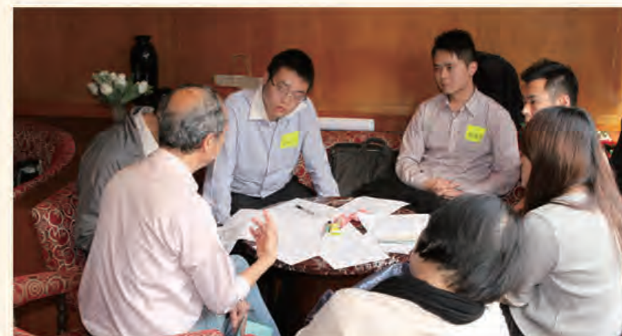
本會同事與懲教署更生事務科 (RU2) 的同工，在茶聚活動中互相交流工作心得。 Our staff and staff of CSD's rehabilitation unit shared work experience at a tea gathering.

Innovative projects such as broadcast programme for prisoners of other nations (O/N) was conducted at Lo Wu Correctional Institution. Social workers have organised 8 programmes on Chinese culture and stress release for 125 O/N prisoners with favourable feedback. To further strengthen the cooperation with the Rehabilitation Unit of Correctional Services Department, a tea gathering was held for the first time for frontline staff of both organisations on 23 March 2012 at the Mariners' Club in Tsim Sha Tsui.