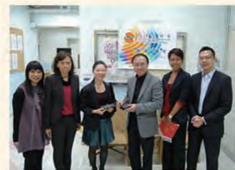
英國領事館職員參觀自強宿舍。 Staff of the British Consulate visited Chi Keung Hostel.