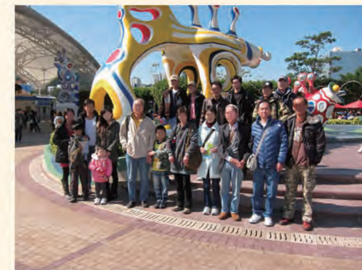
服務使用者帶同家人遊覽海洋公園。 Service users visited Ocean Park with their families.

Chuk Yuen Recreation Centre promoted the theme "Understanding Hong Kong, Caring for Our Community" through activities such as interest groups, outdoor activities and community involvement programmes to promote positive life value and social involvement among ex-offenders.