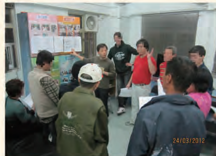
服務使用者正參與康樂中心和基督教牧師教會聯合舉辦的活動。 Service users were taking part in the activity jointly held by the Recreation Centre and the Shepherd Community Church.

Hong Kong Recreation Centre provides service for ex-offenders residing in Hong Kong Island; while Chuk Yuen Recreation Centre provides service for those residing in Kowloon and the New Territories.