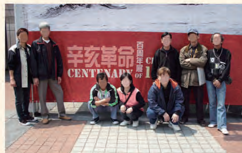
服務使用者參觀香港辛亥革命展覽。 Service users visited the Centenary of China's 1911 Revolution Exhibition.