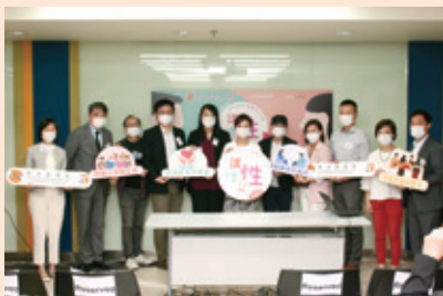
分享會 Multidisciplinary Forum