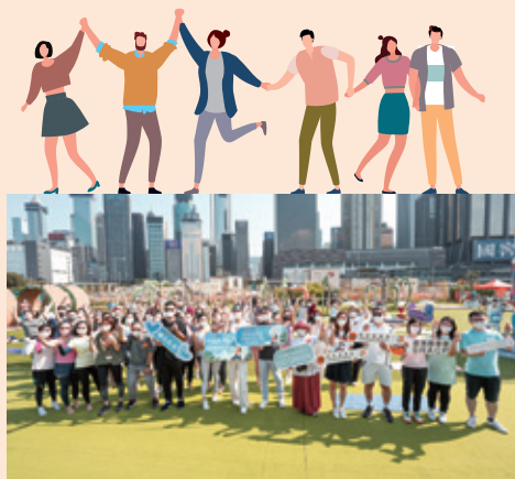
瑜伽日 Charity Yoga Day