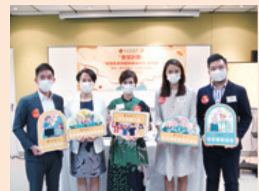
發佈會 Press Conference